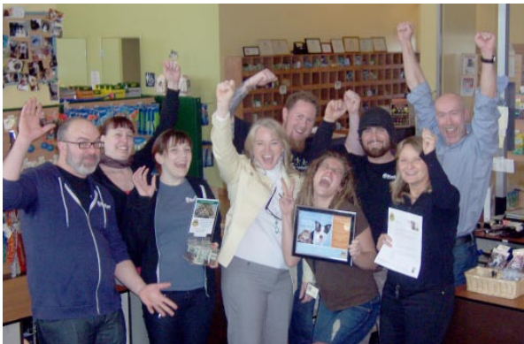
The staff of Mud Bay celebrating their donation canister win!

Throughout the year, several wonderful businesses and individuals hosted fundraisers and friend-raisers to help the animals at N.O.A.H. . Of special note: Palmer’s Restaurant and Fairy Godmother’s in La Conner, Il Granaio and Valley Cadillac in Mount Vernon, Art for Animals Sake, and Furry Friends.