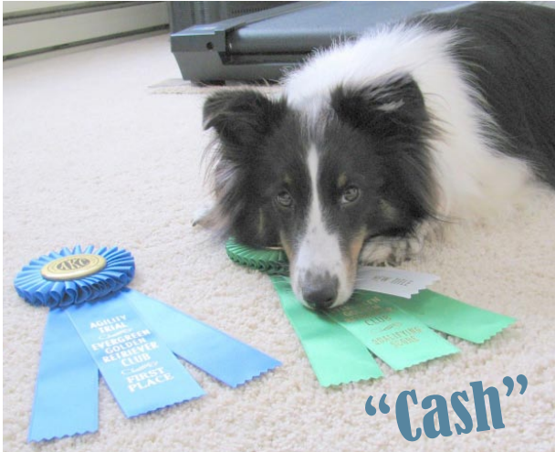
N.O.A.H. Alumni, “Cash” showing off his agility ribbons!

N.O.A.H. is encouraging a lifetime commitment and bond between dogs and their families by offering fun opportunities for them to spend time together. We believe a dog is more likely to stay in its home and not end up at a shelter if it has a strong bond and relationship with its family.