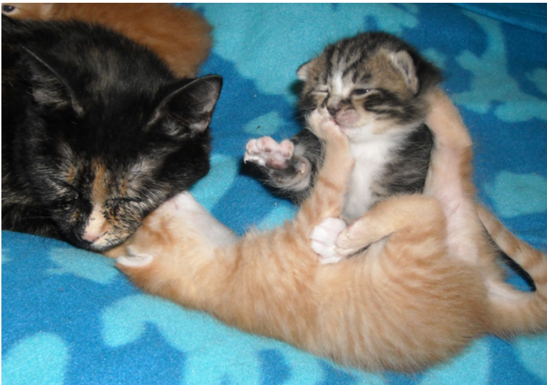
(Foster Program continued)

Donate Foster Program Supplies. These little babies have special needs and we could sure use help getting their special supplies. Here are some things we need: